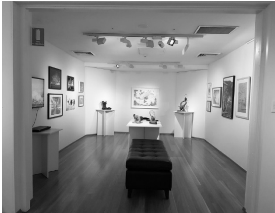
Level 2 Gallery