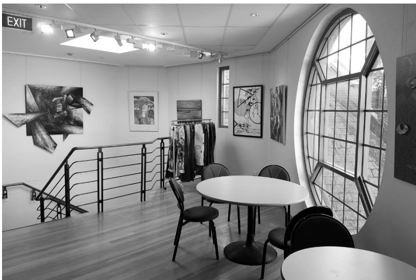
Level 2 Annexe