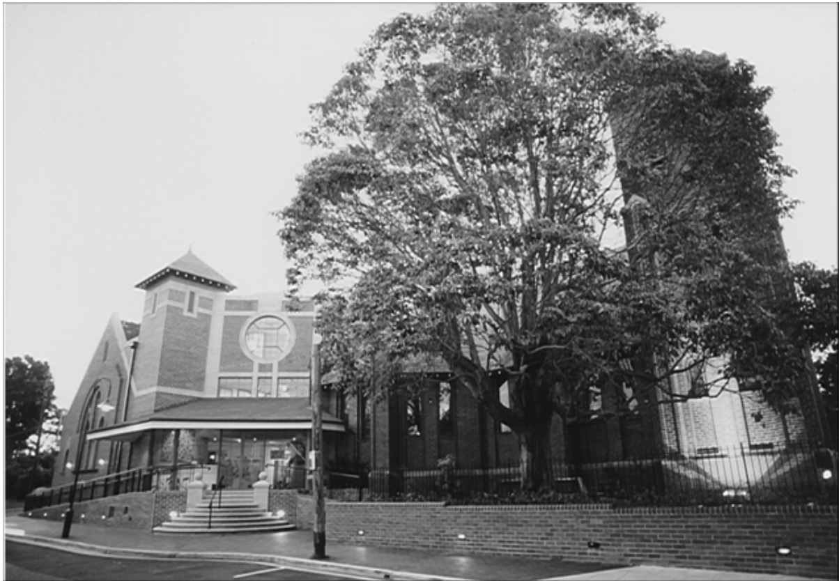
Mosman Art Gallery & Community Centre, 1 Art Gallery Way, Mosman 2088

The centre offers a range of spaces available for hire for various programs and groups, ranging from 5 to 300 people, and is wheelchair accessible. It is the perfect venue for cultural events, wedding ceremonies or receptions, special occasions, cocktail functions, concerts and performances, corporate programs, business and community meetings, expos, health and lifestyle events, conferences and seminars. The centre is fully equipped with a full range of furniture, a commercial kitchen, glassware, crockery, cutlery and napery, audio-visual equipment, a grand piano and many other facilities.